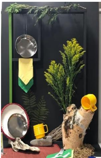
Designer: Sue Donohoe Design Class: 'State Parks' An exhibition table not meant to be functional. Plant material must be used as needed for the overall design.