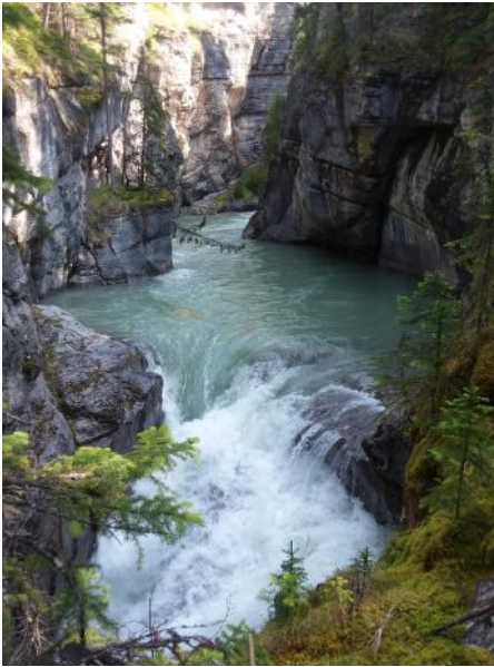
This is a Cool Waterfall by Ryan Veenendall (Youth)