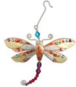
Bright Wings Dragon Fly