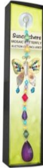
Sun-catcher Butterfly Mosaic