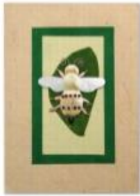
Pin-Card Bumble Bee

Hello from The Milwaukee District Garden Clubs (MDGC). MDGC is offering an amazing and unique fundraiser; just in time for the holidays! Sale is open to all members and to the general public. Items include ornaments, suncatchers and all-season pin cards.