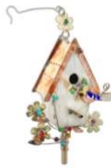
Blue Bird Birdhouse