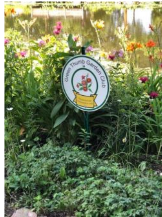
Members of WGCF Tri-Council met in Fond du Lac in July to tour public and private gardens, and view the garden which is cared for by Green Thumb Garden Club. (photos at left)