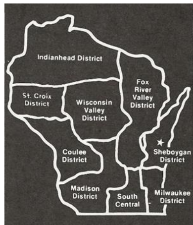
Boundaries in 1991