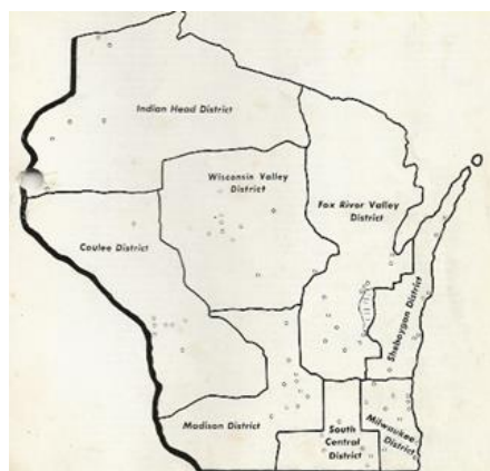
WGCF Districts in 1971