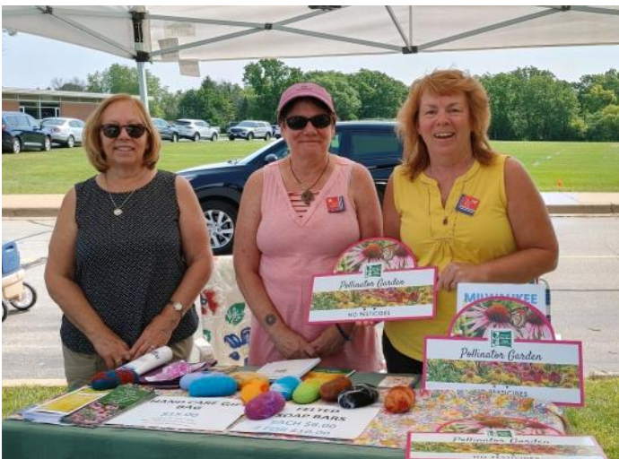
Members off Western Acres Garden Club promoted membership for Milwaukee District Garden Clubs and sold Pollinator Signs during a summer Saturday at Brookfield Farmers Market. (photo at left)