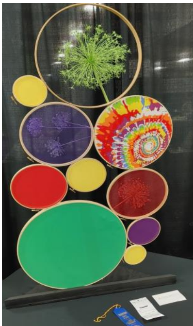
Designer: Diane Olsen Design Class: 'State Fair' Designer's Choice - A creative design usually bold in color, form, and size, yet shows great restraint in the amount of plant material and number of components used. They may have more than one point of emergence, more than one focal area, and some abstraction.