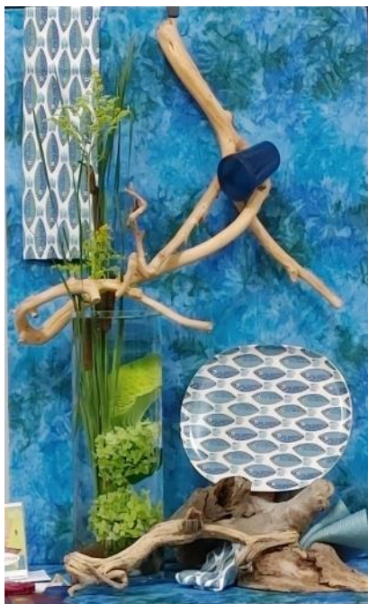
Designer: Gerianne Holzmann Design Class: 'Waterways' An exhibition table not meant to be functional. Must have a completed decorative unit. Designer's choice of plant material. Awarded the Table Artistry Award Award of Design Excellence Winner