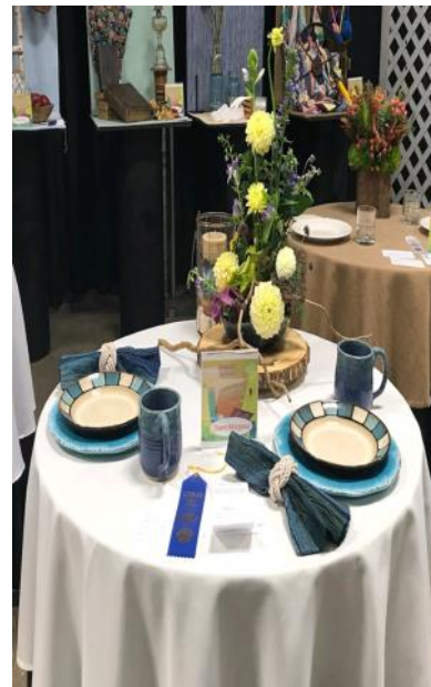
Designer: Dawn Mozgawa Design Class: 'Door County' An informal functional table for two people Convenience and sense of order must prevail. A decorative unit must be included. Coordination of components must be balanced within the allotted space. Designer's choice of plant material