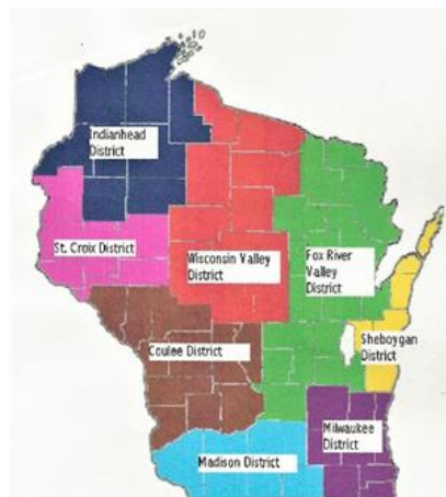
Boundaries according to Counties in 1999