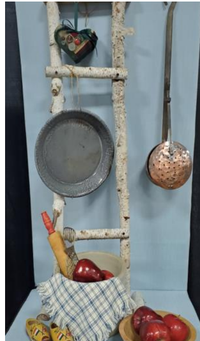
Designer: Carol Catlin Design Class: 'Old World Wisconsin' A Still Life - A traditional or creative non-abstract grouping of functional and realistic objects and plant material with a theme. Objects are more dominant than the plant material.