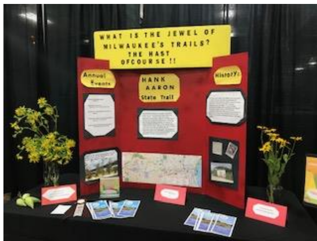
Horticulture entries for State Fair Flower Show (photo at left) Educational Exhibit at State Fair Flower Show (photo above)