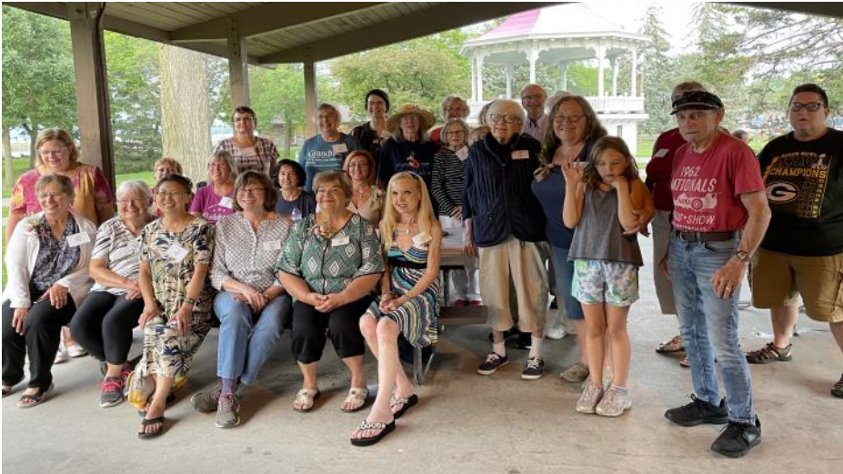
Fox River Valley District Garden Club members welcomed WGCF Officers for President's Day (above photo).