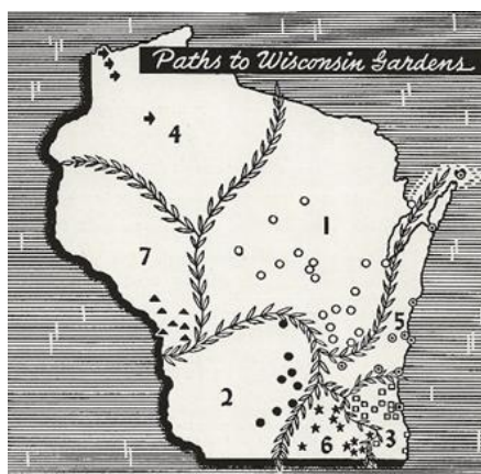
WGCF Districts in 1951