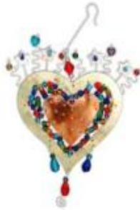
Dazzle Heart Ornament